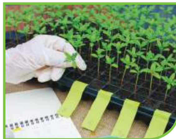
Chemical testing of fertiliser

Development of tools and best practice for nitrogen management to enable growers to make sustainable decisions that are economically and environmentally effective.