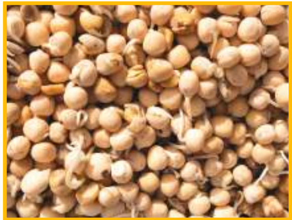
Pea seed germination