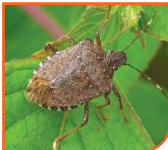
Brown Marmorated Stink Bug

Process Vegetables New Zealand remains a member of the BMSBC with a considerable readiness work programme undertaken in 2022, and further work in 2023. Predominant work has been looking at Samurai Wasp introduction for use in response, as well as various insecticides, insect growth regulators, and insecticide impregnated netting. The process to import and rear Samurai Wasp is the critical focus of Council efforts in 2022.