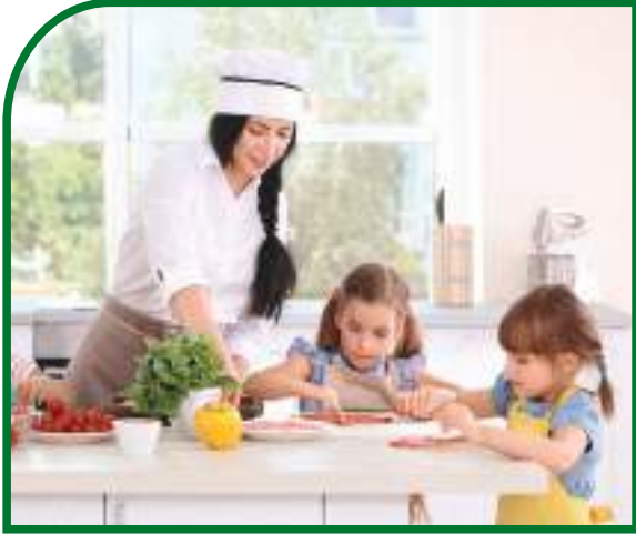
Supporting kids to learn how to prepare and cook vegetables