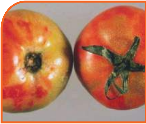
Symptoms of Pepino Mosaic Virus